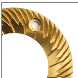
Titanium grinding blade