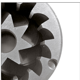
Conical grinding blade